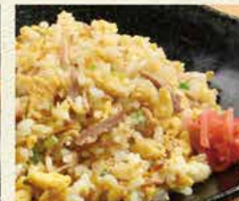
Fluffy Egg Fried Rice

(10pcs) 1,080yen (5pcs) 570yen (3pcs) 375yen