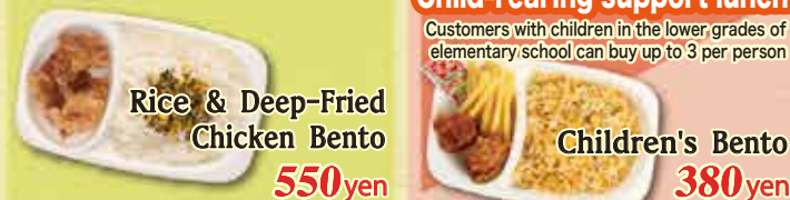
Rice & Deep-Fried Chicken Bento 550yen