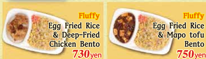
Fluffy Egg Fried Rice & Deep-Fried Chicken Bento 730yen