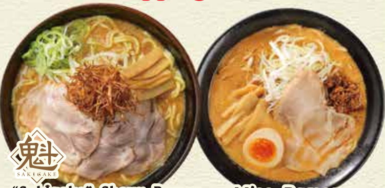
“Sakigake” Shoyu Ramen (soy sauce and pork bone broth-based soup)