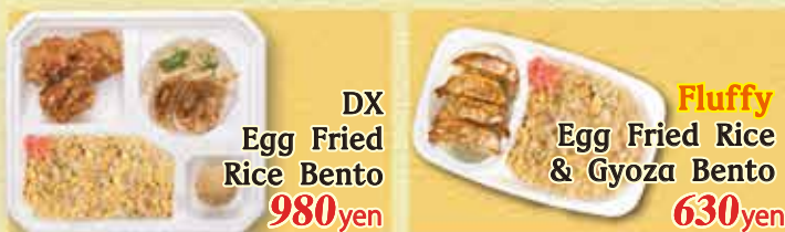
DX Egg Fried Rice Bento 980yen