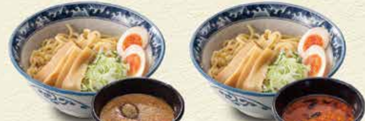
Fish-based Tonkotsu Dipping Ramen