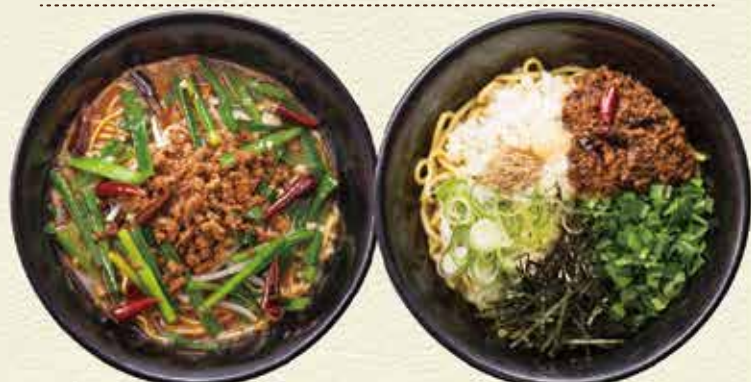
Taiwan Ramen (soy sauce-based soup)