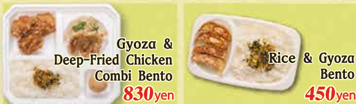
Gyoza & Deep-Fried Chicken Combi Bento 830yen